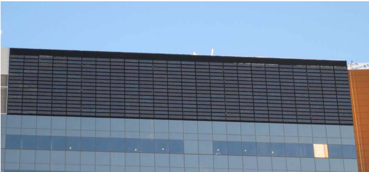
JMSB Photovoltaic/Thermal Solar Wall

The John Molson School of Business (JMSB) building-integrated photovoltaic/thermal (BIPV/T) installation is the first of its kind in the world. The combined generation of heat and electricity optimizes the useful energy generated from the sun, producing three times more heat than electricity. For the thermal aspect, the system will act as a large solar air collector that preheats fresh air to meet the ventilation needs of the building's occupants. As the system operates, the photovoltaic panels – those that create electricity – will be cooled. As is commonly known, cooling electrical equipment, such as computer chips, increases the electrical performance. The same is true for photovoltaic panels.