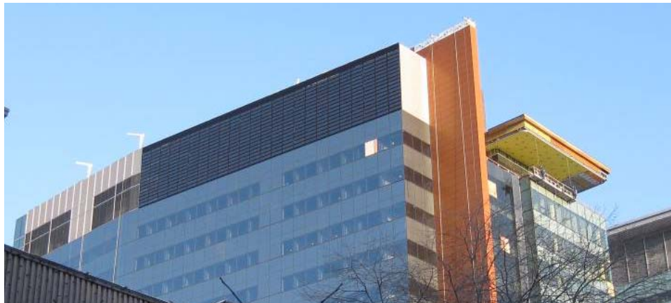
JMSB Building Solar Facade, Concordia University

The LEED® registered John Molson School of Business building will use a single façade surface to generate both heat and electricity from the sun. This type of solar installation is referred to as a Photovoltaic/Thermal (PV/T) application, and it is the first building integrated installation of its kind in the world. The combined generation is expected to have an overall efficiency of about 60% (the rate of utilization of incident solar energy).