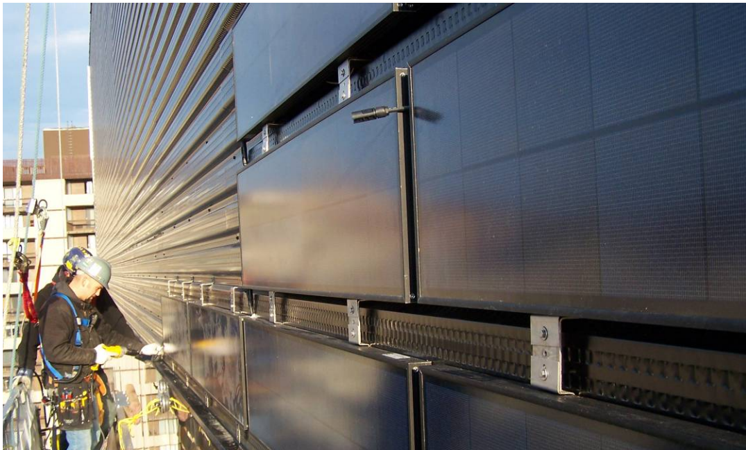
Custom PV modules being installed on the transpired solar thermal air collector

The system will be monitored by a research team at Concordia headed by Dr. Athienitis, the Scientific Director of SBRN. A monitoring room has been allocated to house monitoring equipment in the mechanical equipment floor of the JMSB building. Through monitoring of this innovative system new simulation models will be developed for its design and optimal control.